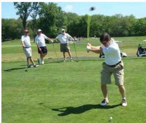
Great weather highlighted last years outing!

The Narragansett Water Pollution Control Association is holding its annual golf outing on Thursday, June 11, 2009. This event will be held at the Cranston Country Club, which is located at 69 Burlingame Road, Cranston, RI, with an 8:00am registration and a 9:00am shotgun start. The cost per person is $110.00, which covers a green fees, cart, a barbecue at the turn, a sit-down dinner, and many prizes. Registration and payment must be submitted by Friday, May 29th.